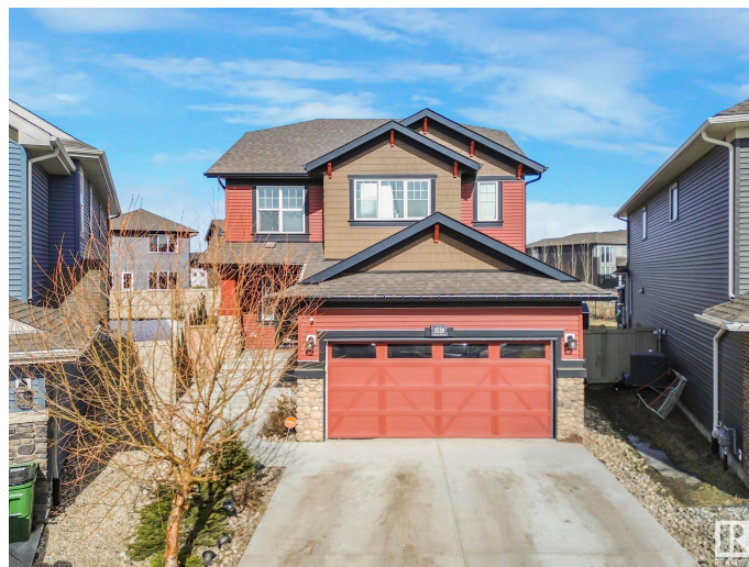
2539 Orchards Way SW, Edmonton, AB

MLS® # E4427515 Price $850,000 Bedrooms 6